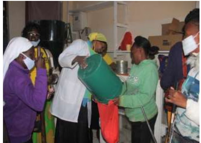
WWDs demonstrating flour gotten from the poshomill after the launch