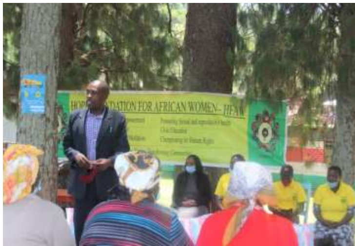
Assistant Chief addressing the participants

Below are Photos showing how exciting the event was