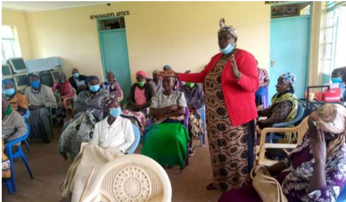
Mosiala during discussion session on why women are not reporting GBV

The international women's day 2021, under the theme, 'Choose to Challenge' was marked through reaching out to 27 women from the Kiang'ende Village, Nyamira County. 2 HFAW CHHRPs and 4 facilitators from the Ministry of Health, department of public health facilitated the sessions. Through this event, we chose to challenge the FGM, GBV, and abuse of children's rights in the region. The objective of the outreach was to empower the rural women from Kiang'ende village on how to challenges issues that hinder their development.