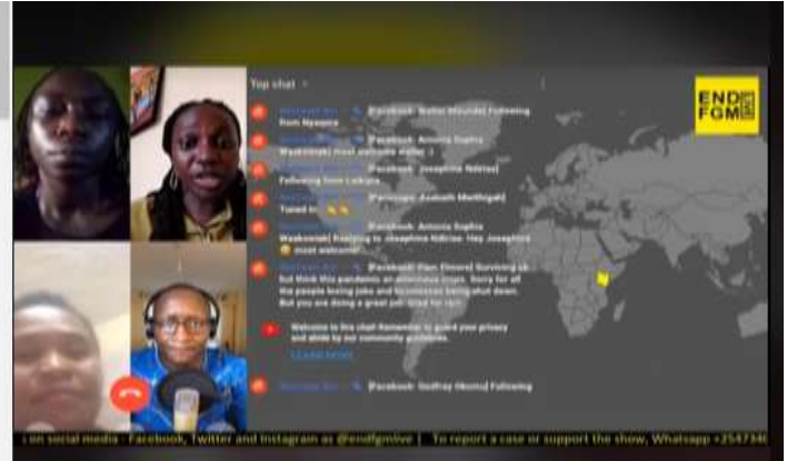
(Top Right) HFAW's Lancer Wao participating in the End-FGM podcast