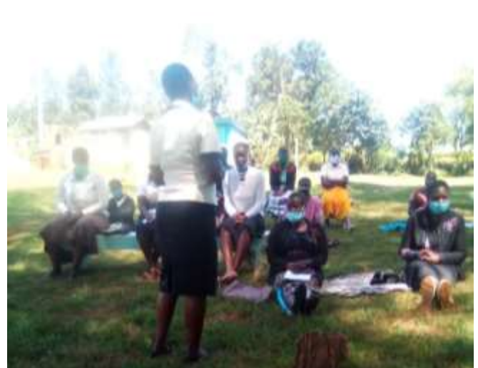
Participant sharing experience on the training