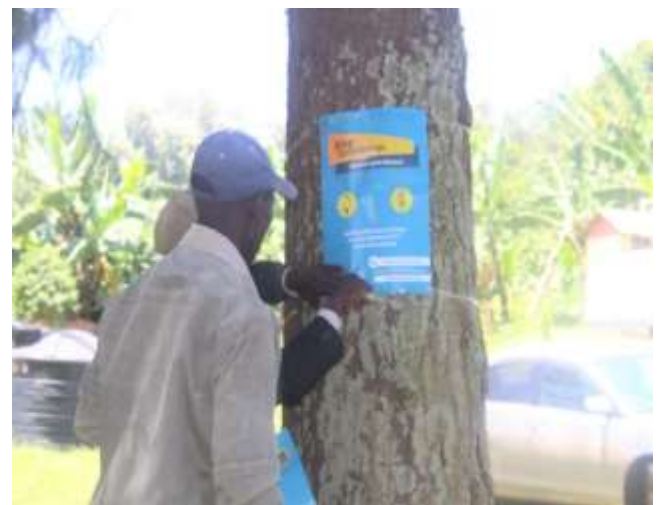
Demonstration of Covid-19 Awareness information