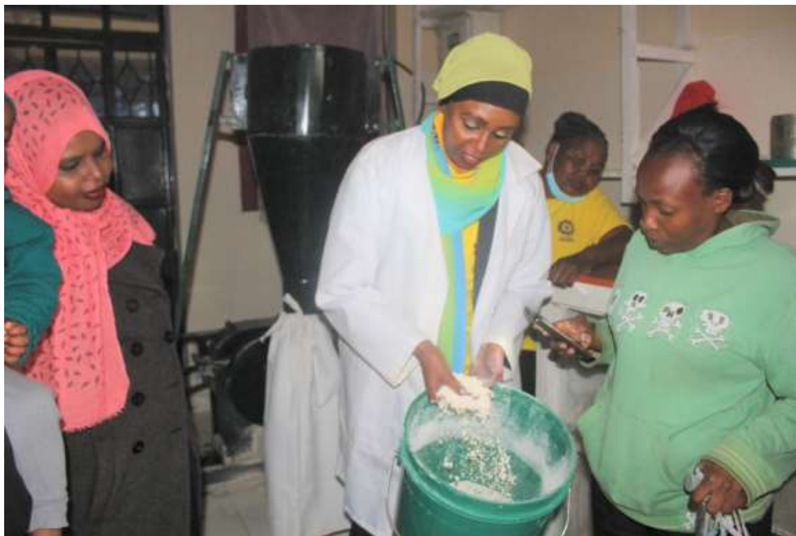
WWDs showing the first flour milled through the machine after the launch

The goal of the leadership, business management, and financial literacy project was to protect full economic rights and justices for women living with disabilities (WWD) supported by the African Women Development Fund is to promote economic rights of WWD will empower them to organize themselves and participate in the formal in informal economies. The activities of the project included training of 24 women living with disabilities from Kajiado County, conduct monthly mentorship sessions to help cement the skills and knowledge acquiring from the 3-day training, provide financial support to the trained WWDs to start and/or support the growth of their businesses from the HopeFund Kitty, conduct media outreach mainstream and showcase the importance of the project to WWDs and advocate for the economic rights for WWDs, and publish 2 editions of Ability magazine detailing the journey of the women to financial freedom. The project was implemented successfully despite the restrictions of movements as a result of Covid-19 safety protocols enforced by the government of Kenya. It is important to note that the first part of this project was implemented in 2019 and reflected in last annual report.