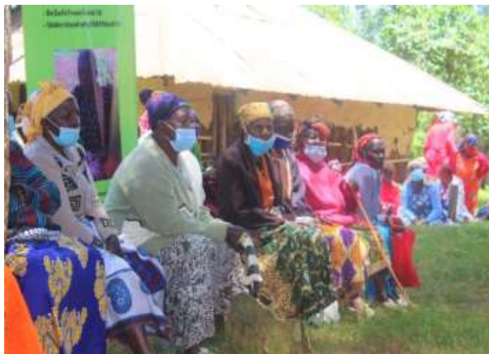
A section of the Elderly and WWDs