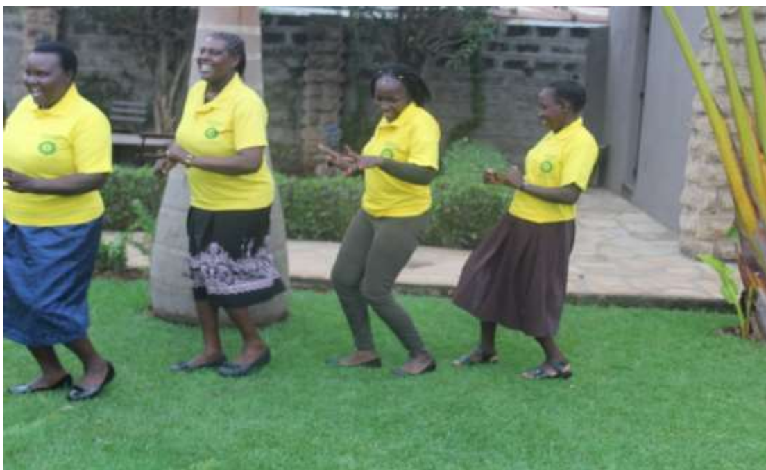
Some of HFAW staff during staff retreat

This grant helped HFAW staff in self-care activities as they are often overworked and underpaid due to limited resources. Other activities in the short project included capacity building (see report below on Motivating staff), advocacy in the community through media and collaboration with community health volunteers to create awareness on Covid-19 safety measures, continue sensitizing the community on the health effects of FGM, and promote respect for children's rights during a time when parents and guardians were dealing with a lot of socio-economic issues. Through this project, we reached 264 school-young adults at Riamoyi secondary school, 300 adults in the community, and over 40,000 people who directly listened to the radio shows.