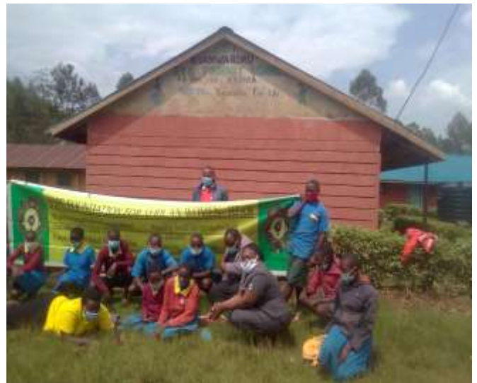
Group photo during a school visit