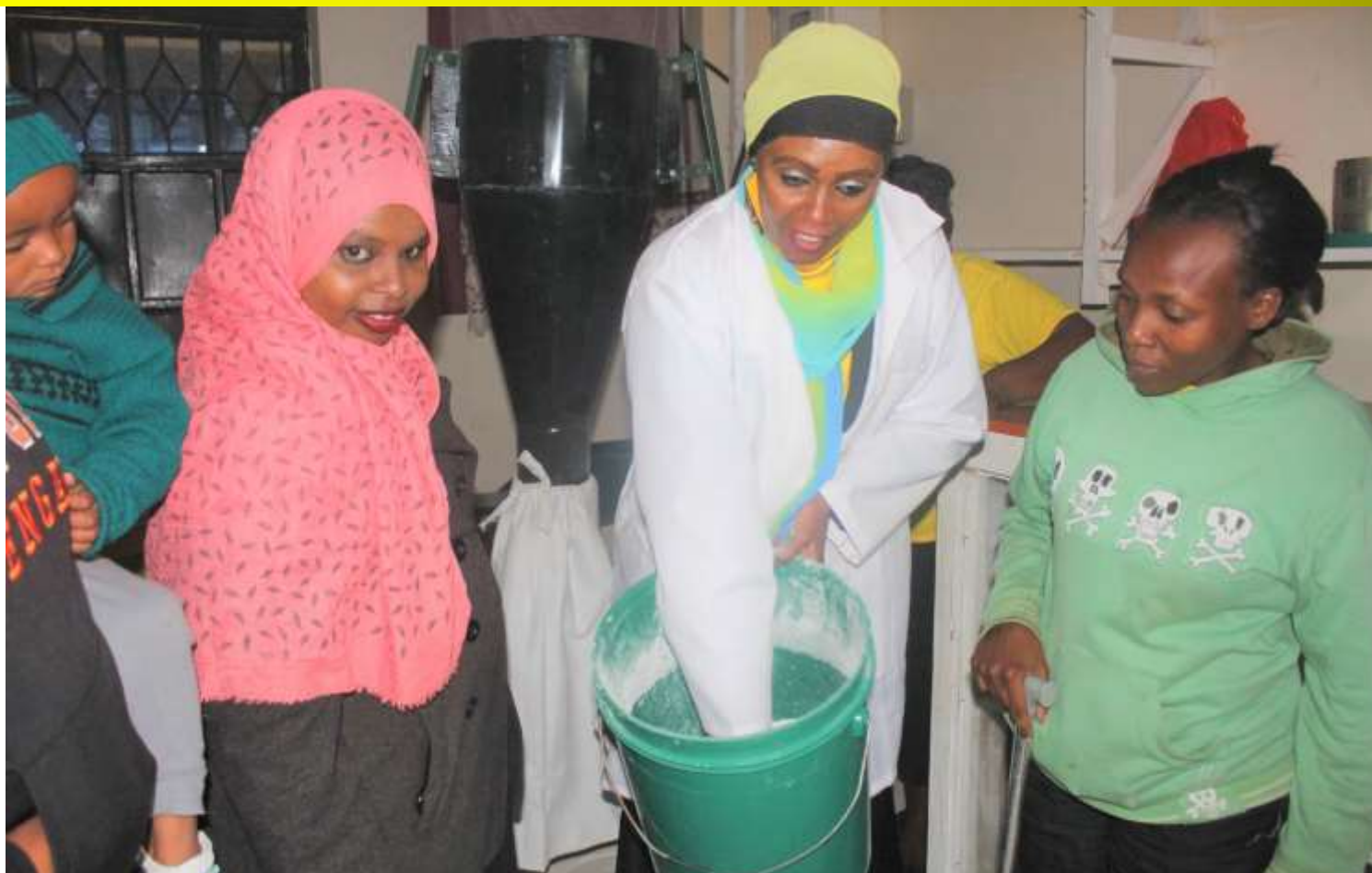
Women of Hope Abled Differently launched their poshomill business!