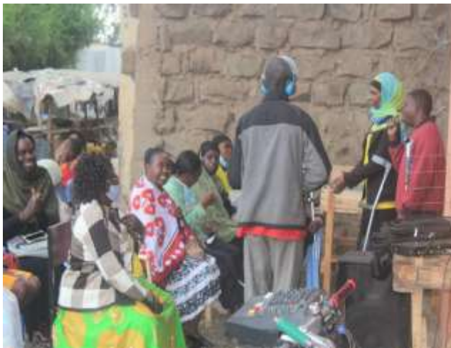
Entertainment session during the launch

Apart from the women, in attendance were two men living with disabilities who offered to provide entertainment during the launch. Both were visually impaired; one a DJ and another an upcoming musician. This was significant moment of unity of PWDs in that they support each other something that we could all emulate if we wish to go far. Also, the moment signified that disability of any kind should not be a hindrance to pursue dreams. Below are additional photos of the launch: