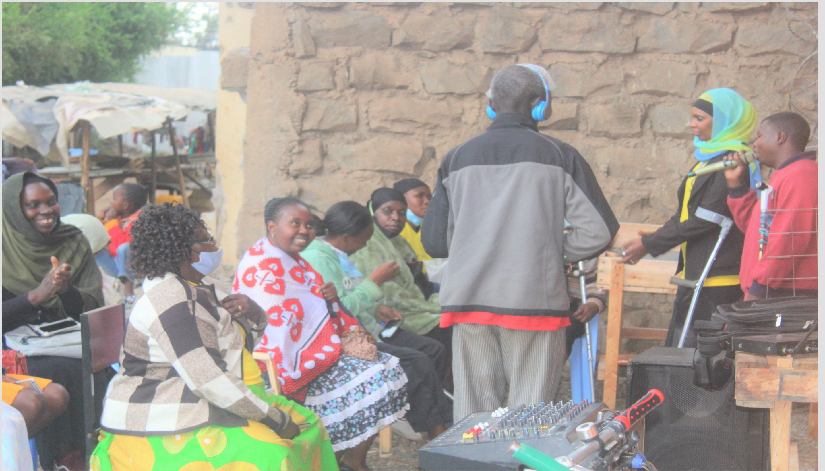
Picture of WHAD members being entertained during the launch of the poshomill